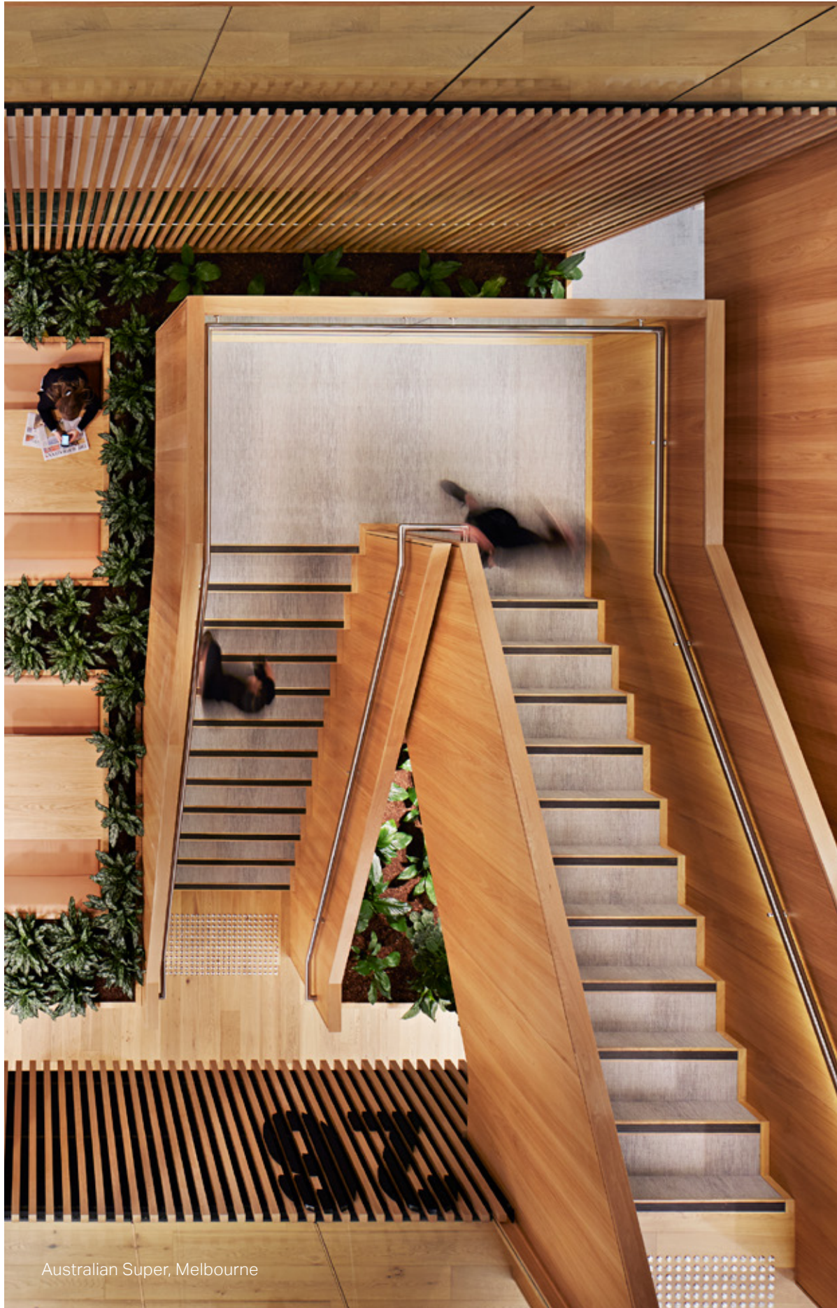
Australian Super, Melbourne